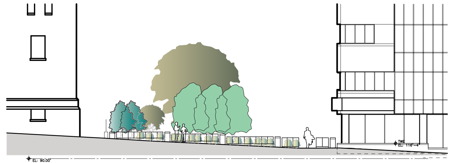
3 EAST ELEVATION