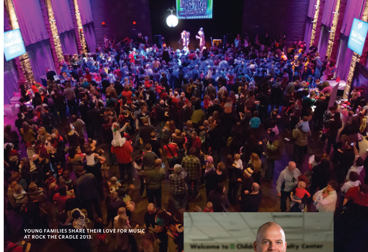
YOUNG FAMILIES SHARE THEIR LOVE FOR MUSIC AT ROCK THE CRADLE 2013.

in-studio performances and Rock the Cradle reveal The Current’s most significant impact — the joy of connection between the performers and the audience.