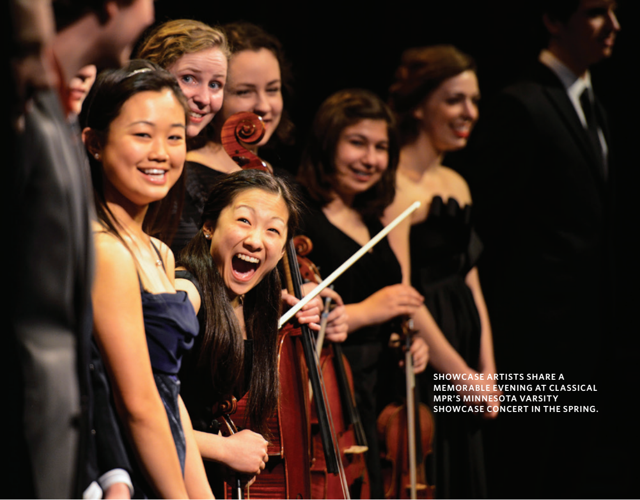
SHOWCASE ARTISTS SHARE A MEMORABLE EVENING AT CLASSICAL MPR'S MINNESOTA VARSITY SHOWCASE CONCERT IN THE SPRING.